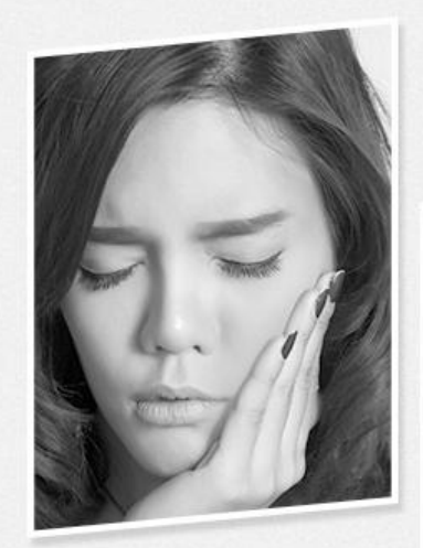
Swelling and aching of gum