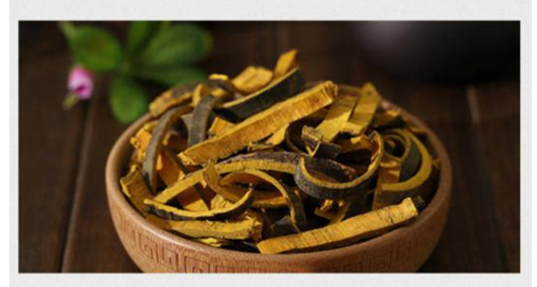
02 NATURAL COMPONENT